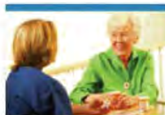
The Role of Medication Modification in Falls Prevention and Reduction